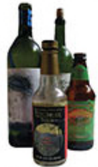
Glass jars & bottles