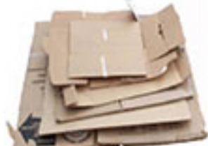
Corrugated cardboard (flattened)