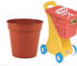
Flower pots, plastic toys