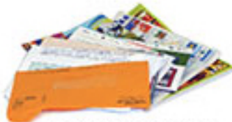
Mail, mixed paper, and catalogs