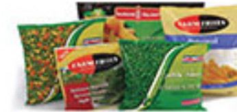
Frozen food bags