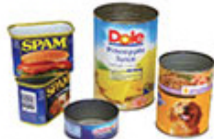
Clean metal food cans