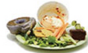
Food & wet waste, food contaminated paper plates and napkins