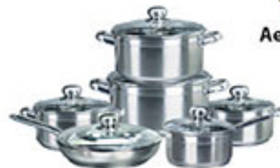
Pots & pans, scrap metal, ceramics