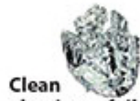
Clean aluminum foil wrap and pans