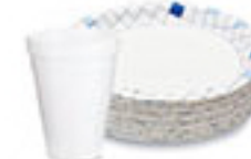
Styrofoam containers, styrofoam peanuts or packing