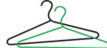
Plastic and metal hangers