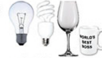
Light bulbs, drinking glasses, other glassware