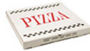
Take out pizza boxes