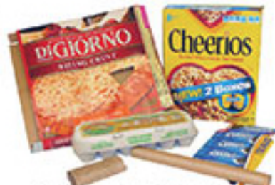
Boxboard, cereal boxes, frozen food boxes