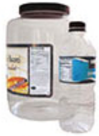
Plastic bottles (necks smaller than base)