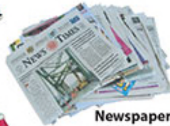
Newspaper & inserts