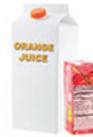
Wax-coated paper containers and juice boxes.